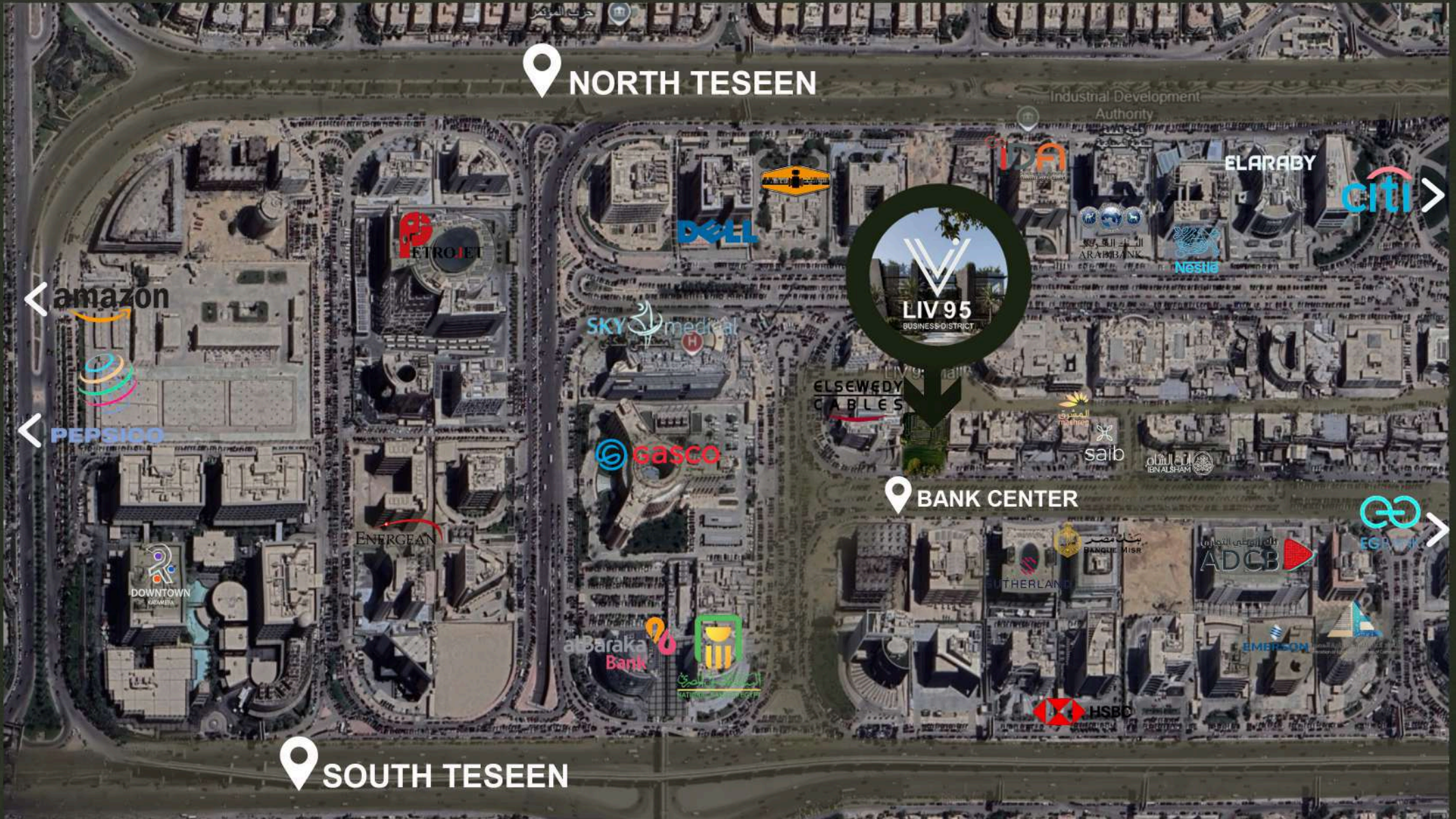
BUILDING 95, DOWNTOWN 1ST SECTOR, NEW CAIRO